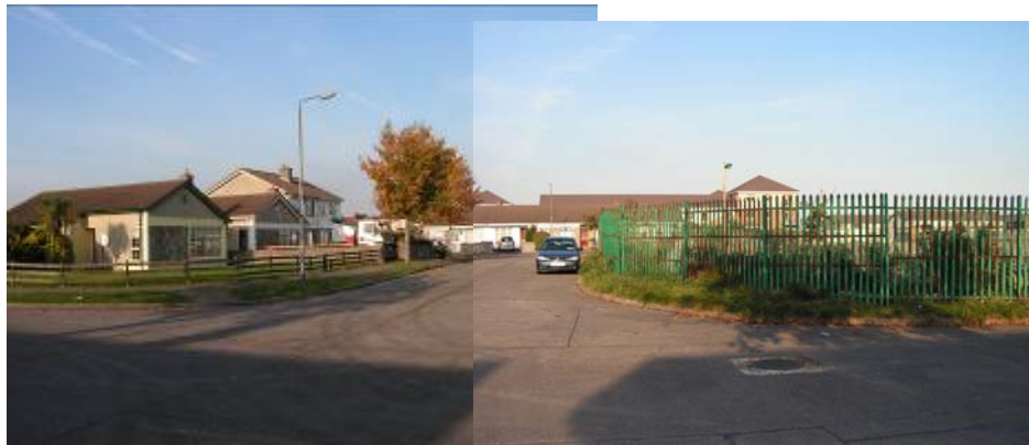
View in Suncroft Drive cul de sac / site / Russell Square