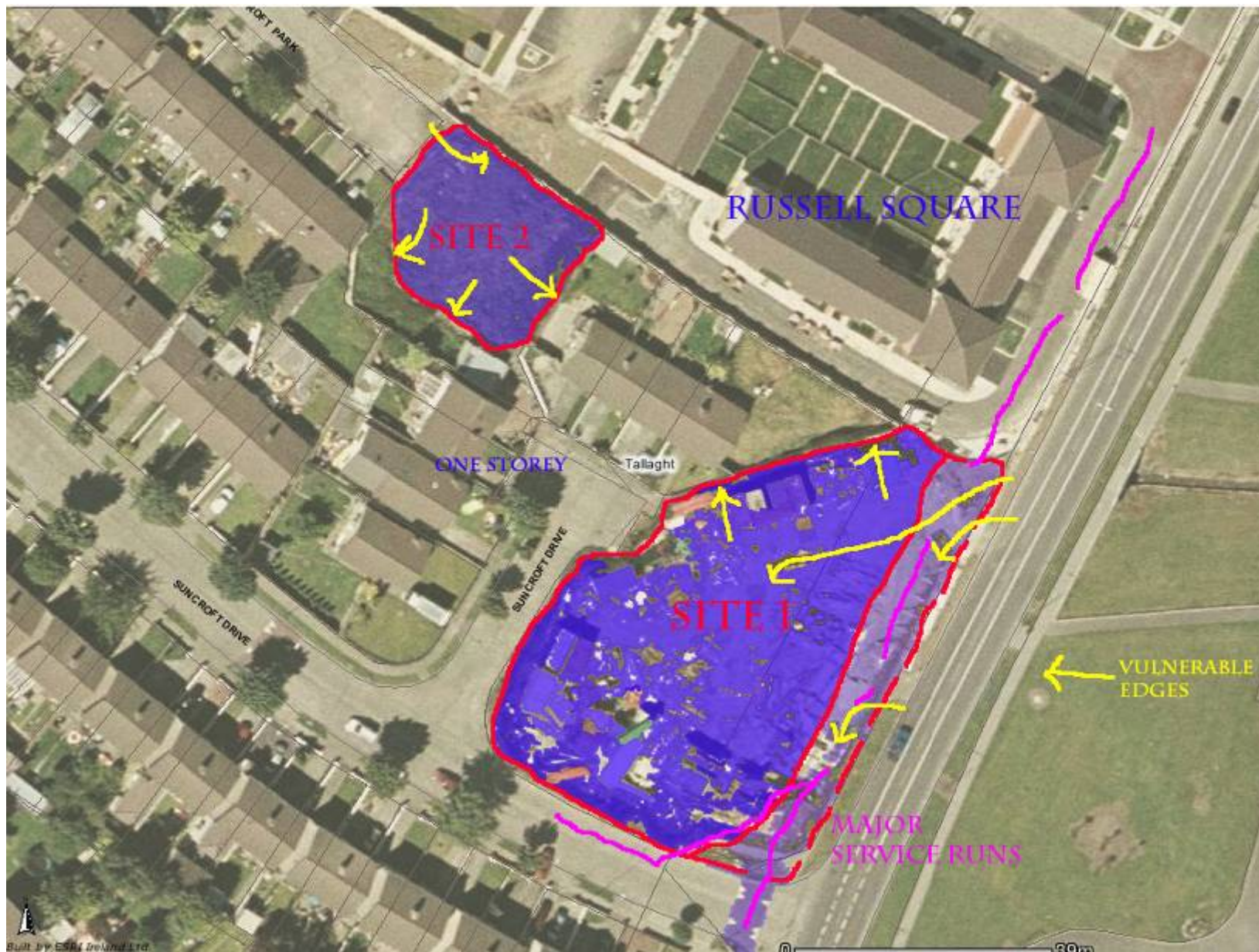
Interface between Suncroft & Russell Court