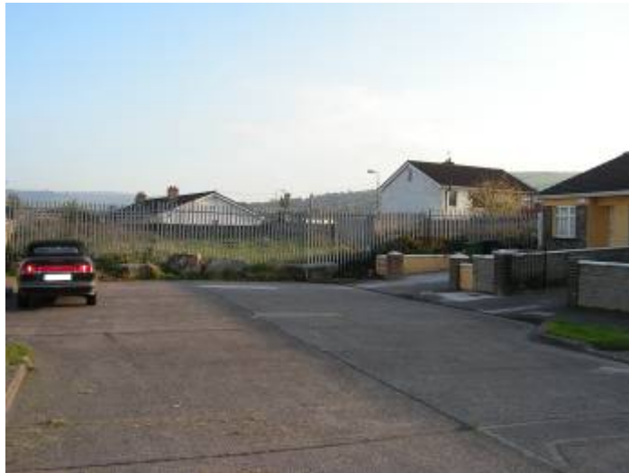
View to site at end of Suncroft Park

NOTE ALTERATION TO LAYOUT IN RESPONSE TO PREVIOUS PRESENTATION COMMENTS