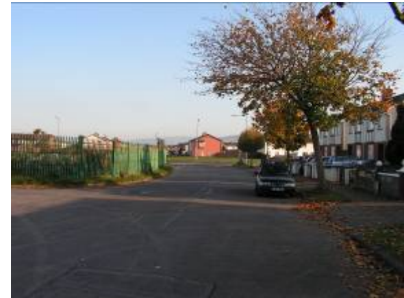
View to site and exit onto Jobstown Road