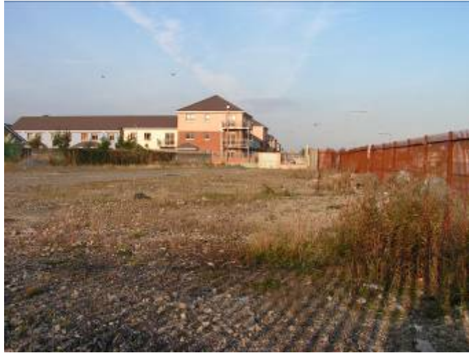
View across site to Russell Square

Road access to site will be similar to / same line as Russell Square with minimal traffic entering Suncroft