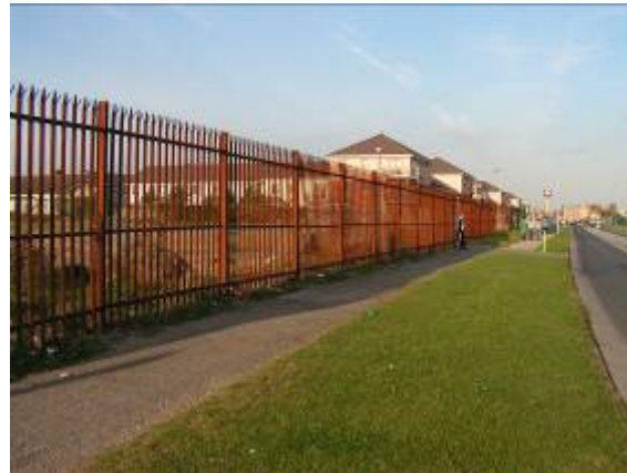
View along site to Jobstown Road / Russell square