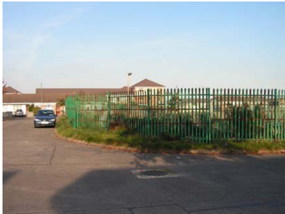
View to Russell Square / Suncroft Drive / site